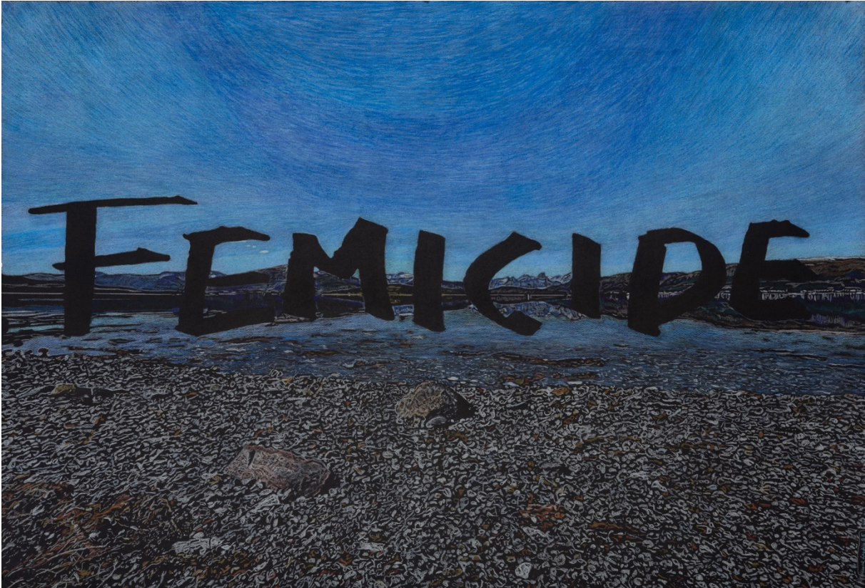
'Sunny Day' by Hanne Lydia Opøien Figenschou, 2025, coloured pencil on paper, 75x110 cm