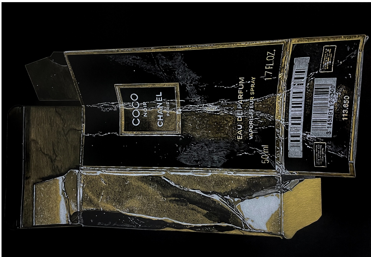
'NoirShame' by Hanne Lydia Opøien Figenschou, 2025, coloured pencil on paper, 75x110 cm

Hanne Lydia's works, meticulously created with coloured pencils on black paper, unfold as fragmented visual narratives shaped by overwhelming impressions and contemplative perceptions. She started the series of drawings under the working title 'Shame', inspired by the results of the World Happiness Report. As Norway consistently has ranked in the top 10 happiest nations worldwide, she decided to use the Happiness project as a backdrop. She later renamed the series 'Happiness is Easy', inspired by the eponymous title track of the British band Talk Talk. Much like the drawings, the song evokes an ambiguous and subtly unsettling vision of happiness while exploring our ongoing quest for it and the many personal and collective forces that can give rise to feelings of shame.