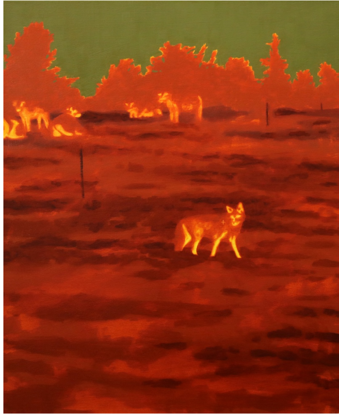
'Huge Coyote Problem' by Diego Herman, 2024, oil on canvas, 75x62 cm

Using the visual language of a globalized landscape as a starting point, Diego Herman explores notions of ownership, habitat and alterity in compositions that depict places devoid of human figures. He uses the motif of the fence as an industrial object whose constant form is part of a universal vocabulary. He depicts fences all over the world, used to protect territory and keep out unwanted intruders, whether human or animal. By stating that " what interests me in the act of painting these elements of the landscape is that, by becoming the focus of attention, they reveal human weaknesses ", Diego Herman pushes the viewer of his painted landscapes into the political realm, as they become portraits of our society. His exploration of the ways in which bodies are marked by territory and borders highlights their active role in the artificial constitution of territories of all kinds. To exemplify, his series entitled "Huge Coyote Problem" (based on a YouTube film in which an American cattle farmer employs military tools at night to kill coyotes attacking his cows) addresses the theme of migration in a well-considered manner. Although native to the area, the wild animals are unwanted by the colonizers wanting to make a profit out of the non-native cows.