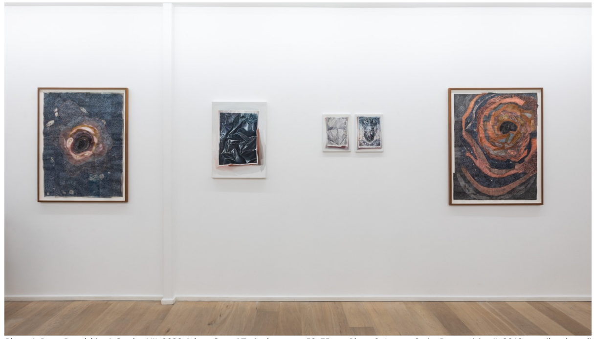
Photo 1: Peter Depelchin, A Garden VII, 2020, ink on Gampi Torinoko paper, 52x75 cm; Photo 2: Juanan Soria, Desaparicion II, 2018, pencil and acrylic on paper, 29x23x1cm; Photo 3: Installation view ground floor: Maelström drawings by Peter Depelchin and oil paintings by Juanan Soria

fluorescent red back of the paper is an integral part of his art, symbolising both the act of aggression and the fragility of the artefact.