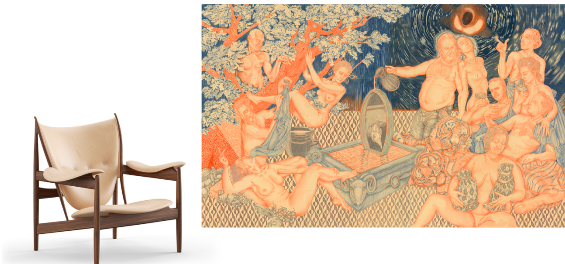
Left: 'Chieftain Chair' by Finn Juhl, designed in 1949