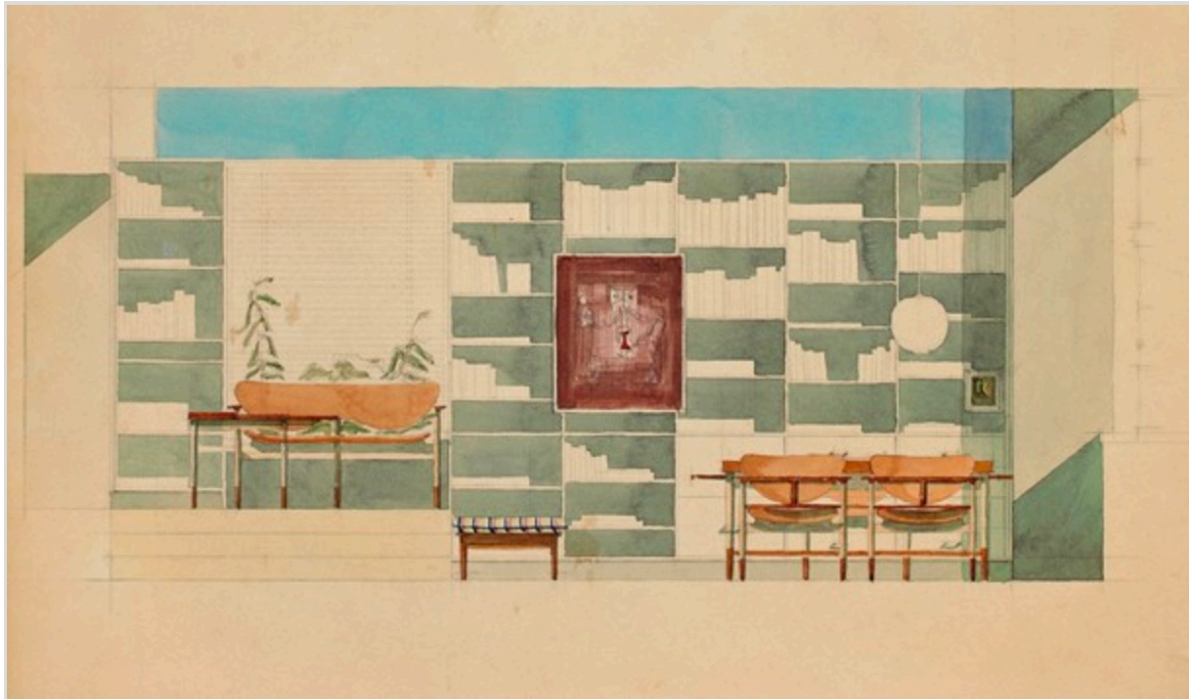
Finn Juhl's watercolour drawing of his interior design 'Study for an art collector' in 1948

The exhibition is launched in collaboration with Onecollection, the Danish company who has the unique right to reproduce and sell his furniture under the label 'House of Finn Juhl' and Designhus - the hotspot for Nordic design in Tervuren. On the occasion of 'Brussels Design September 2022' Designhus will present a fine selection of Finn Juhl's furniture design in Brussels and Tervuren. As part of the exhibition, the visitors are invited to sense the tactile aspect of the exquisite furniture by touching them and sitting in them. Both at Husk Gallery's space in Rivoli Brussels (13 > 30 Sept) and at Designhus in Tervuren (4 > 30 Oct), design pieces by Finn Juhl are presented with the refined drawings by Belgian artist Peter Depelchin.