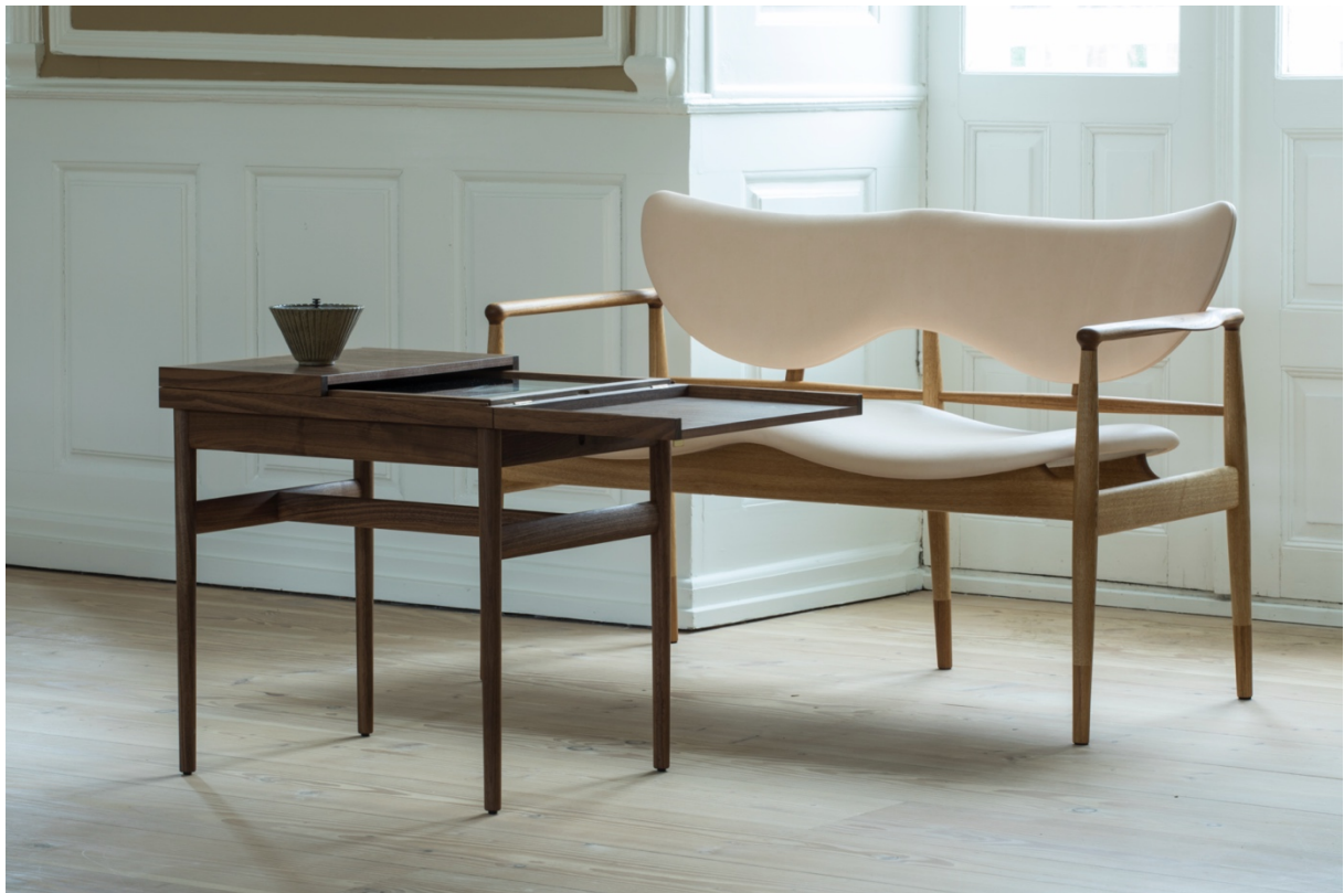
'48 Sofa Bench' and 'Art Collector's Table' designed in 1948 by Finn Juhl ©House of Finn Juhl

POP-UP EXHIBITION BY DESIGNHUS AT HUSK GALLERY