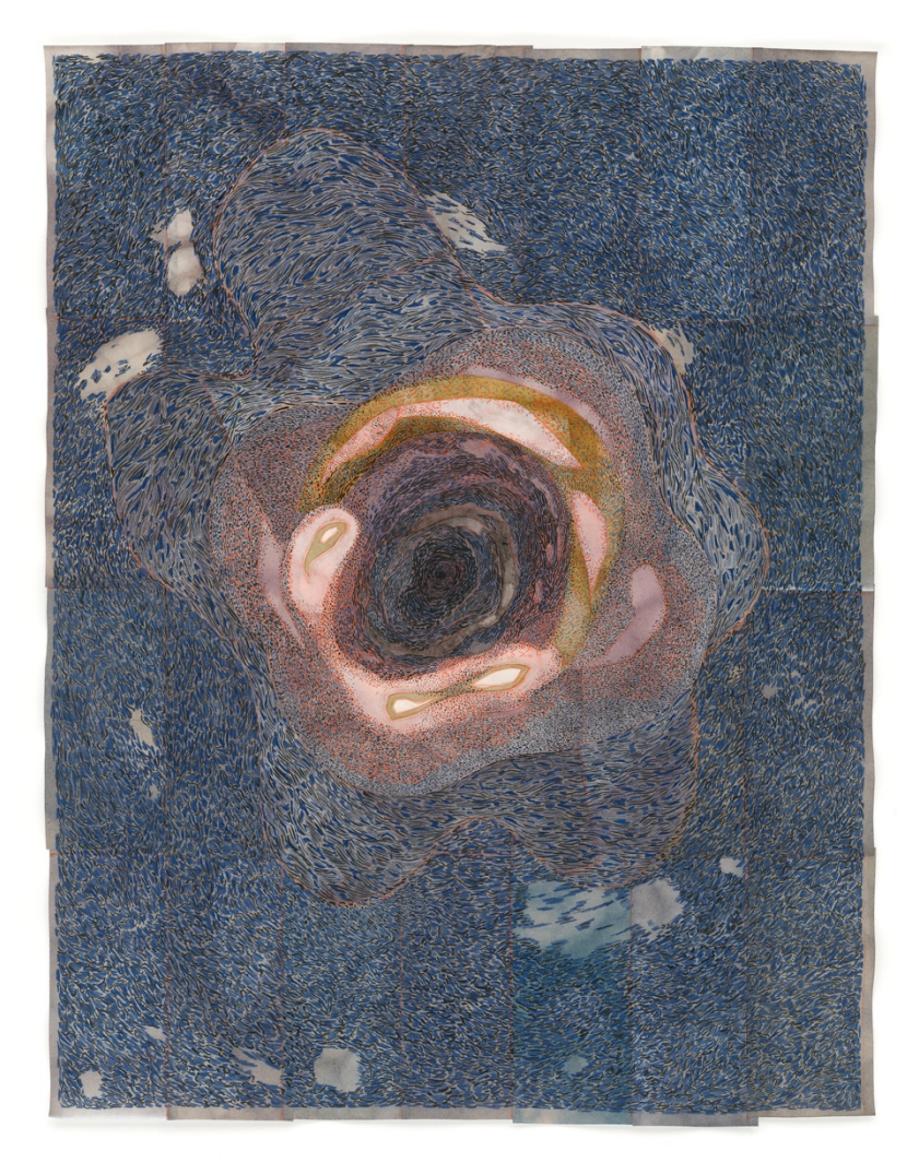
{\it 'Ma\"elstrom' by Peter Depelchin, 2022, colour pencils and Chinese ink on collage, 95x75~cm}

Husk Gallery is delighted to present Peter Depelchin's second solo show in its gallery space in Rivoli Brussels. Peter Depelchin returns with a refined and coherent series of drawings evoking both space and time. Depelchin's specific interest in astrophysics and his passion for mythology come together in this show beyond imagination. The artist sheds new contemporary light on Greek tragedy and Dionysian mysteries in the present context of scientific discoveries and cosmological imagery.