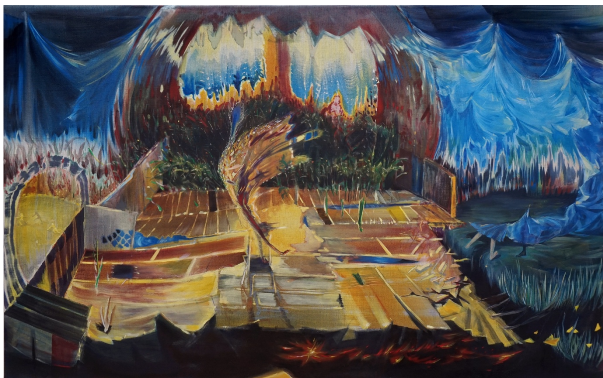
'Wobbly Floor' by Akiko Ueda, 2021, oil on linen, 90x145 cm

Husk Gallery is delighted to present 'Enclosure Undone', the first exhibition by Akiko Ueda, in its gallery space in Rivoli Brussels. This solo show by the Japanese artist features her recent series of paintings created during her current residency in Brussels.